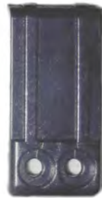
Inserted plate for clip