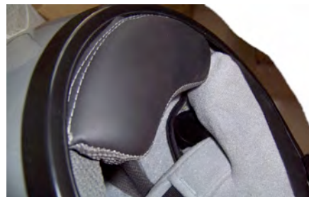
the speaker with long wire cord for right ear