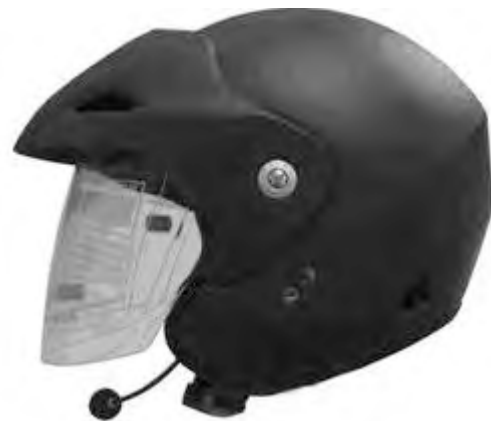
Correct position of the microphone