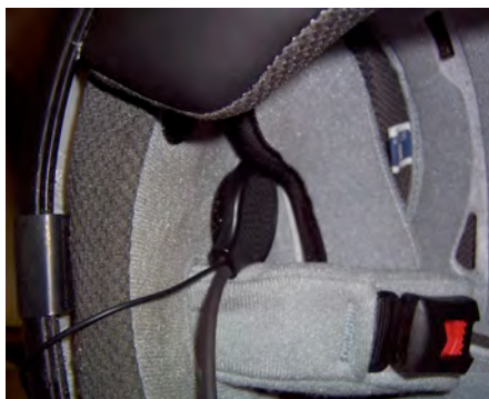
the speaker with short wire cord for left ear