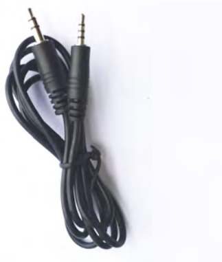
2.5-3.5mm audio adapter cable

With the 2.5-3.5mm audio adapter cable attached, it will can be used for connecting your BIM with a major of MP3. play the MP3, you will can listen to the music via the speakers of your BIM .