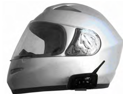
BIM mounted on a helmet